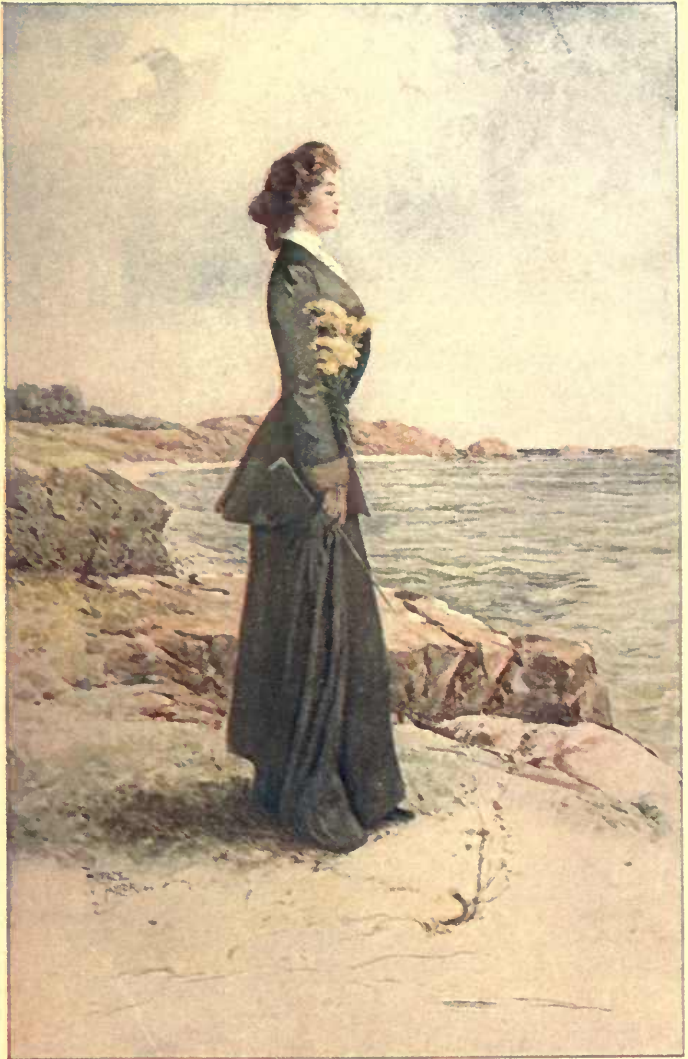
“That’s a portrait of Miss Carden—Miss Jessie Carden of Boston,” said Blake.